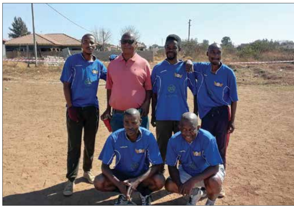
Fandoza FC players eagerly waiting to take part during the Dennilton Old Cocks 5-Aside Soccer Tournament held at OR Tambo Sports Grounds in Dennilton