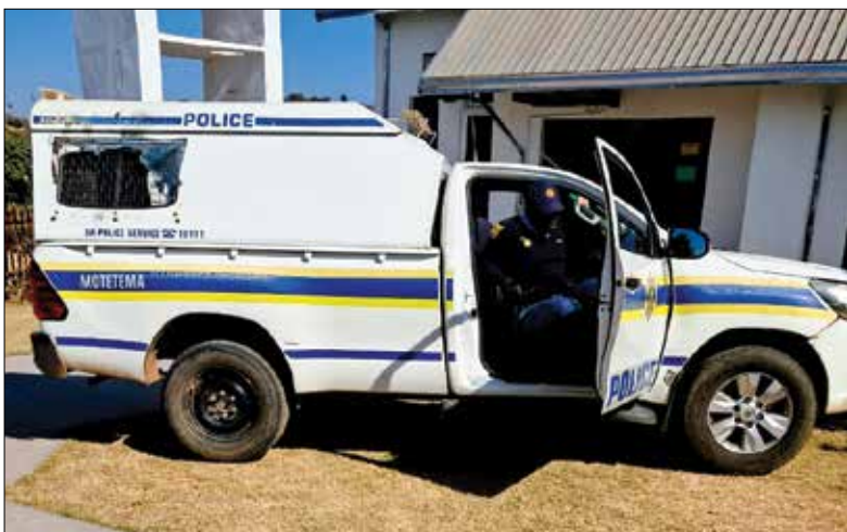
A 36-year-old Police Constable stationed at Motetema was arrested in connection with Culpable Homicide and Drunken Driving after he allegedly knocked down an 8-year-old child at Mogaung Village who later succumbed to his injuries.