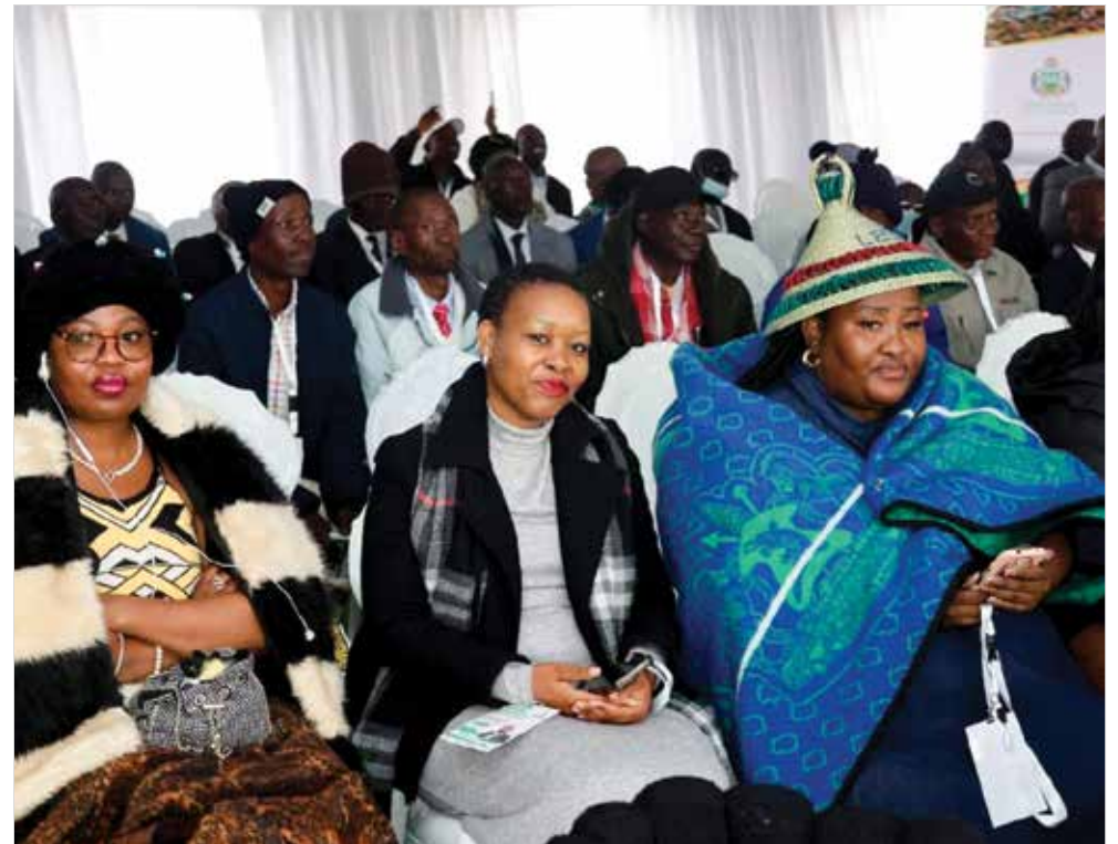
Dignitaries during SOLMA at Ga Motodi