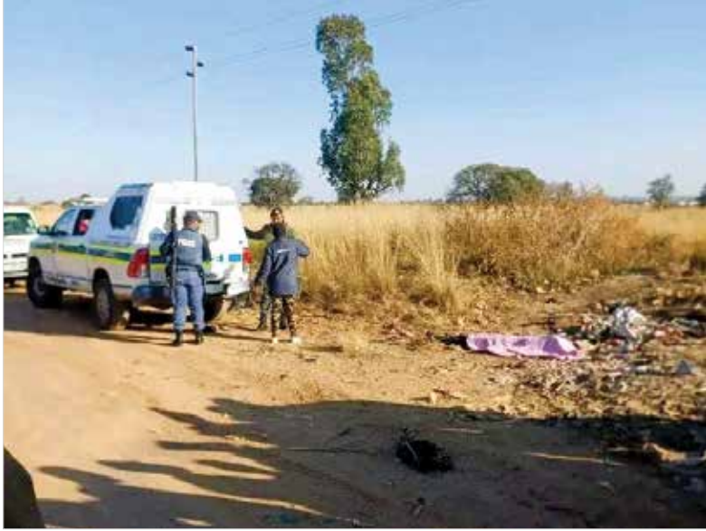
The police in Marble Hall arrested a 43-year-old woman following the brutal murder of her husband committed at Leeuwfontein outside Marble Hall