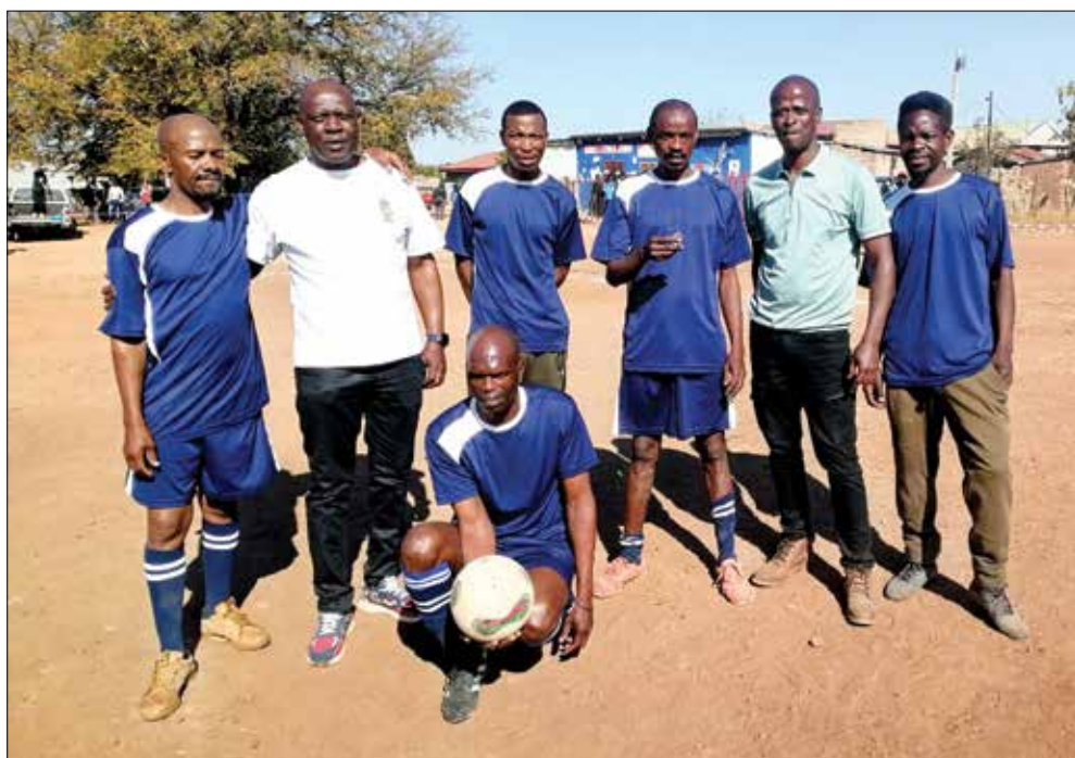
De Branch FC suffered a humiliating 4-1 defeat against Kia FC during the 5-Aside Soccer Tournament.