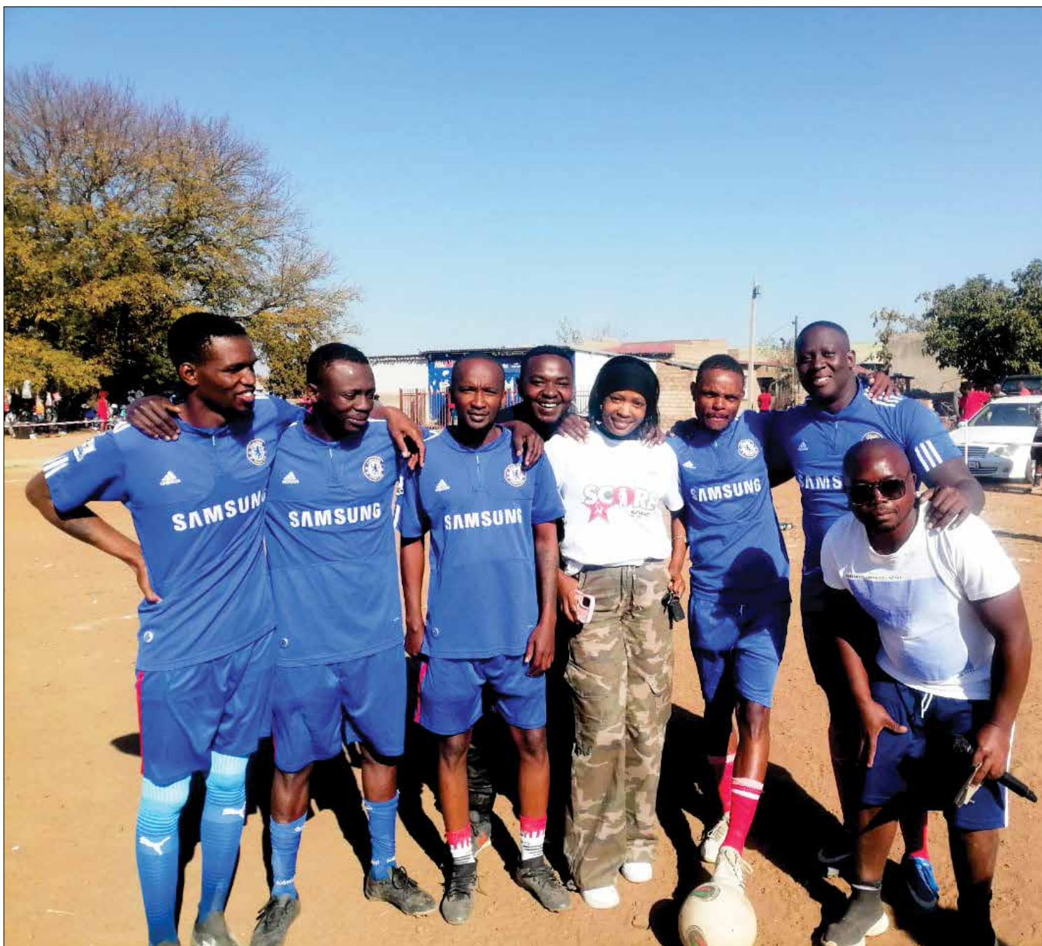
Black Door FC moments before they take part in the Dennilton Old Cocks 5-Aside Soccer Tournament held at OR Tambo Sports Grounds in Dennilton.